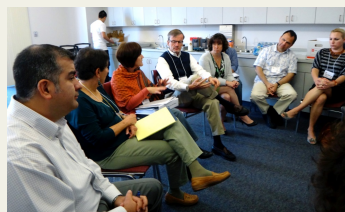
Authentic, critical dialogue among stakeholders