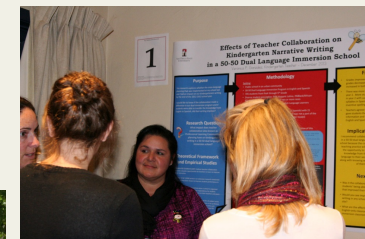
In-service teachers present their action research projects